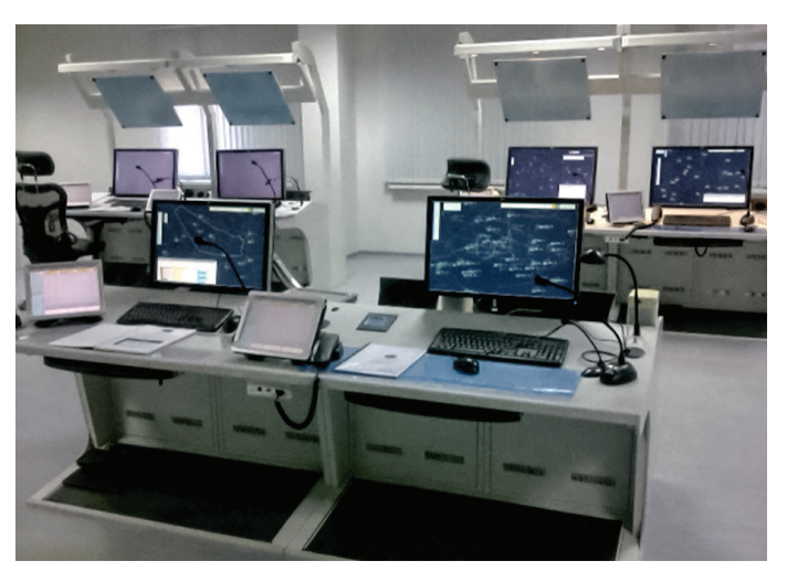
ACCP Controller's Console