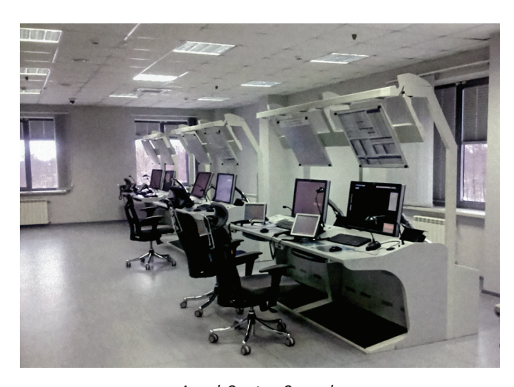
Areal Center Console